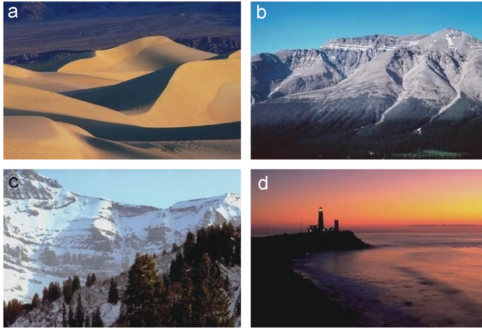
Fig. 4. Some example images on which ML-KNN works better than BOOSTEXTER, ADTBOOST.MH and RANK-SVM. (a) Ground-truth: desert , ML-KNN: desert , BOOSTEXTER: desert + trees , ADTBOOST.MH: null , RANK-SVM: mountains ; (b) Ground-truth: mountains , ML-KNN: mountains , BOOSTEXTER: mountains + trees , ADTBOOST.MH: trees , RANK-SVM: trees ; (c) Ground-truth: mountains + trees , ML-KNN: mountains + trees , BOOSTEXTER: null , ADTBOOST.MH: mountains , RANK-SVM: mountains ; (d) Ground-truth: sea + sunset , ML-KNN: sea + sunset , BOOSTEXTER: sunset , ADTBOOST.MH: null , RANK-SVM: sunset .