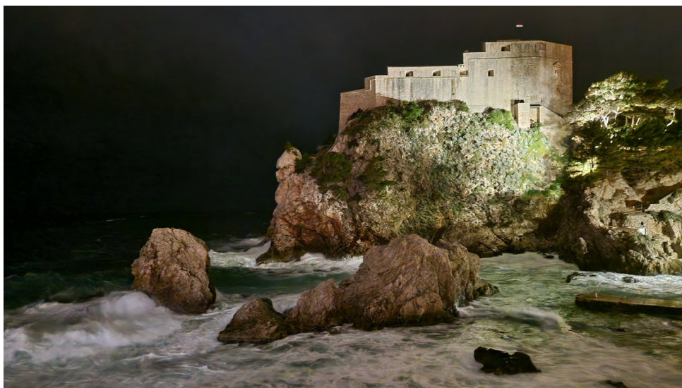
A night photo of Fort Lovrijenac.