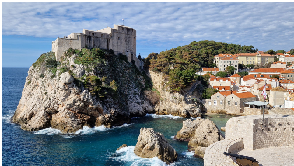
A photo recently taken from the Dubrovnik City Walls. On the left side is Fort Lovrijenac. CAAS is the yellow building on the right.